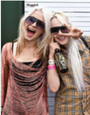
Revellers get into the groove at the 1-2-3-4 Shoreditch festival

6 th - 8 th Worlds Together 6th - 8th September 2012 Tate Modern, Bankside, London SE1 9TG Worlds Together is an ambitious project aimed at exploring the