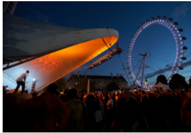
Celebrating our great river at the Mayor's Thames Festival

The Mayor's Thames Festival takes place in September each year celebrating the main waterway which winds its way through the heart of the city. This year the festival is taking place on the closing weekend of the London 2012 Paralympic Games; so expect big crowds and a euphoric atmosphere. There's a carnival ambience to the two-day event with street entertainment, art installations, music and dancing all performed at various riverside locations between Westminster Bridge, Tower Bridge and beyond. All this fun entertainment is free and, for the grand finale, there's a colourful night procession featuring