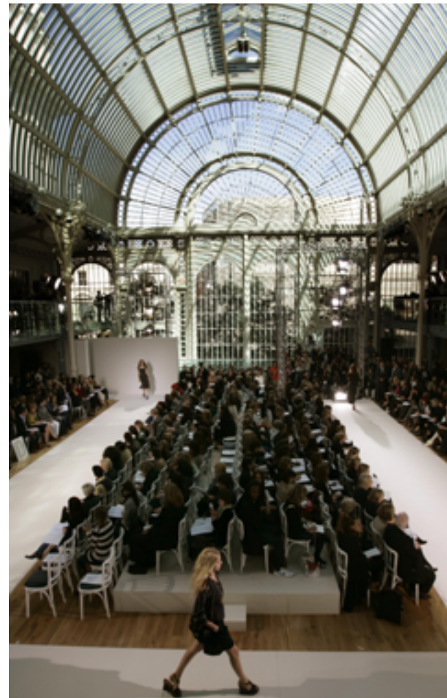
London Fashion Week: models hit the Royal Opera House catwalk

Regarded as the rowing equivalent of the London Marathon, the Great River Race is bursting with colour, spectacle, intense competition and casual fun. Due to tides, the 2012 race will be run upstream for the fifth successive year, starting at Millwall Slipway in London's Docklands