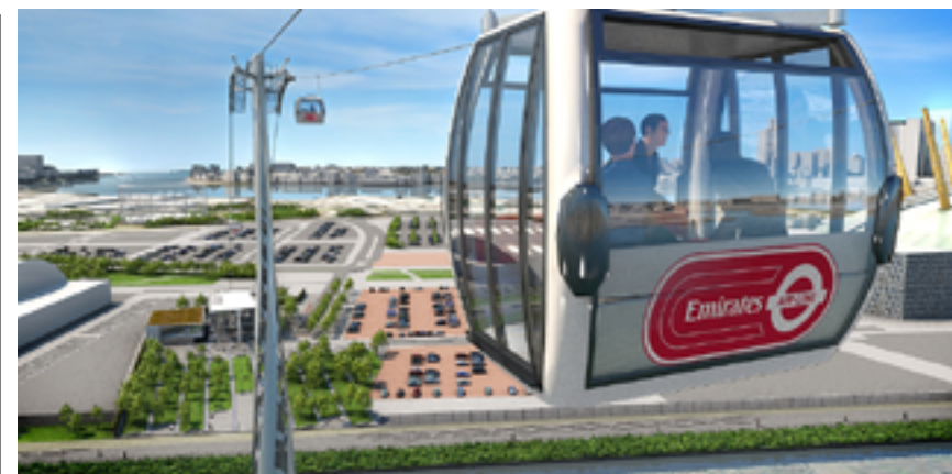
The Thames cable car will be called the Emirates Air-Line following a sponsorship deal

If Boris can pull this one off and the Emirates Air-Line is ready in time for the Olympic Opening Ceremony on 27th July 2012 then it could well be one of his biggest achievements. Regardless of its completion date, the Thames cable car will be an extraordinary legacy to London.