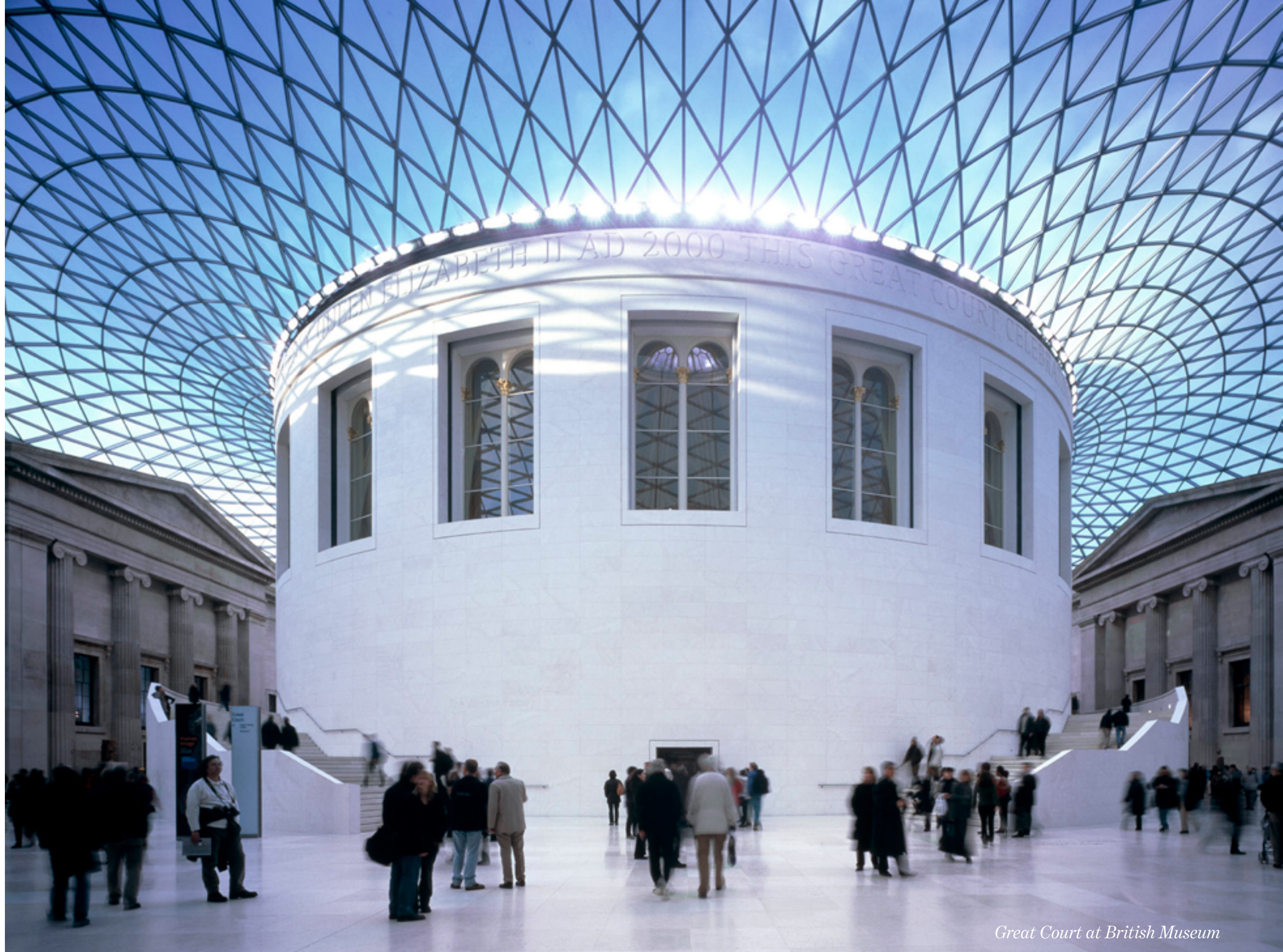
Great Court at British Museum

Fashion Week and the Design Festival return while patriotism soars with Last Night of the Proms as Juliette Binoche and Michael McIntyre take to the stage.