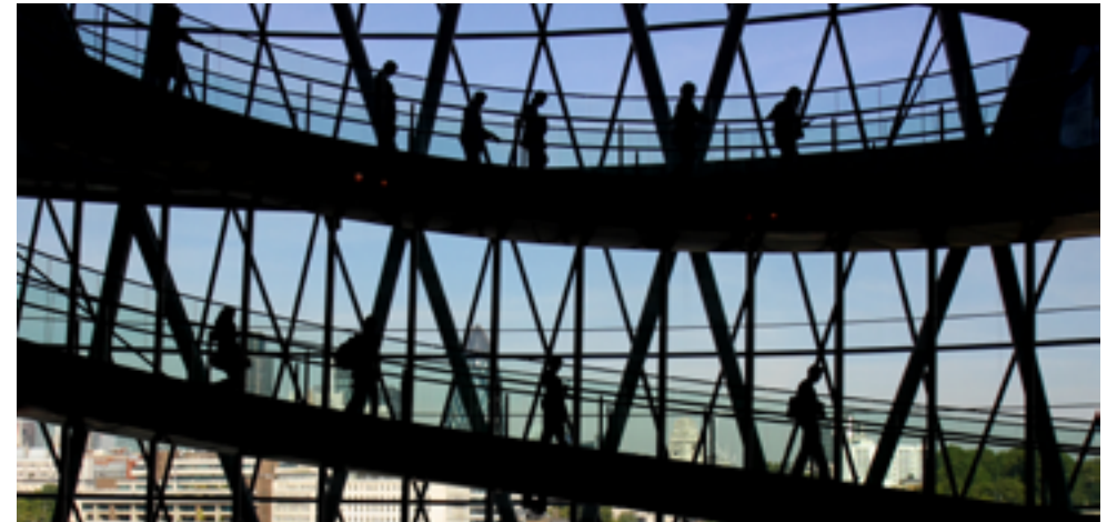
The annual Open House Weekend gives members of the public the chance to visit buildings like City Hall

some of the grandest private homes in your own neighbourhood - it's a voyeur's dream come true. For the more serious students of contemporary design, this is a chance to visit spaces by famous modern architects. An inspired idea and a real treat whether you're a lover of architecture or just plain nosy. Entry to some of the houses is only permitted via pre-booked tickets on the official website.