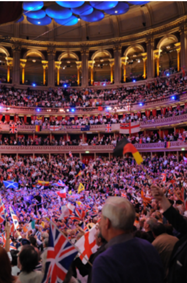
Rule Britannia: out come the flags at the Last Night of the Proms

8 th Last Night of the Proms Saturday 8th September 2012 Royal Albert Hall, London SW7 2AP T HE WORLD FAMOUS LAST NIGHT OF THE PROMS at the Royal Albert Hall brings the terrific summer season of The Proms (see also: The Proms - Royal Albert Hall - 13th July - 8th September 2012 PAGE 98 ) to a fitting finale. Described by conductor Jiri Belohlavek as "the world's largest and most democratic musical festival", the much-loved classical celebration now encompasses more than 100 concerts each year. The Last Night is traditionally very different from the eight weeks that precede it, following a lighter, 'winding-down' vein and often pandering to popular classics and Patriotic Anthems (Rule, Britannia!, anyone?). Tickets are almost as hard to come by as Centre Court passes for the Wimbledon finals, but like the tennis, the whole thing is broadcast live on the BBC - and all round the world. Plus there's the simultaneous Proms in the Park party, usually hosted by Terry Wogan.