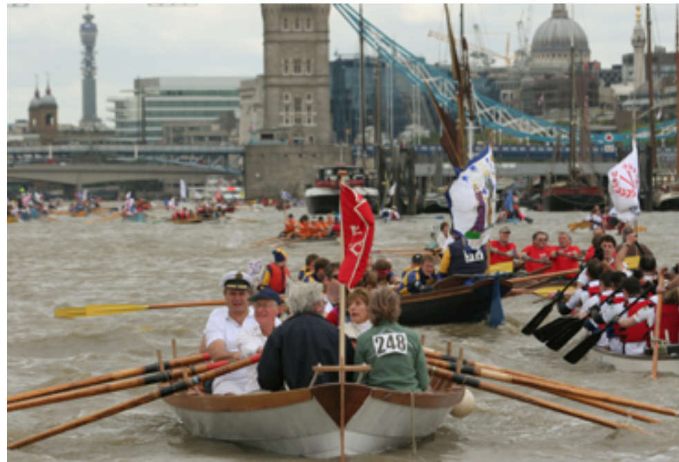
The Great River Race features 300 boats carrying over 2,000 competitors and racing for 35 trophies

at 10.30am and finishing with a spectacular riverside party at Ham. The extensive 21-mile course takes crews from the industrial cityscape of Docklands all the way along the Thames to the idyllic semi-rural Richmond shores. Since launching in 1987, entries have snowballed from a mere 72 entrants to a massive 300 boats carrying over 2,000 competitors, racing for 35 trophies. Festivities along the river at Richmond will begin at noon with live music, a children's beach, donkey rides and food and drink stalls.