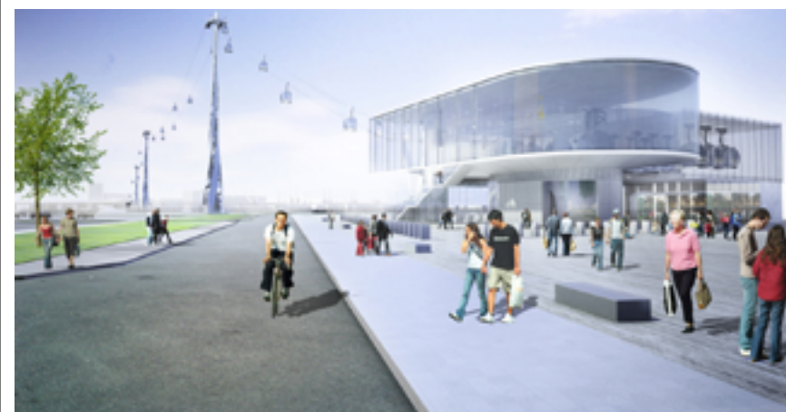
An artist's impression of how the £60m Emirates Air-Line will look once it's completed