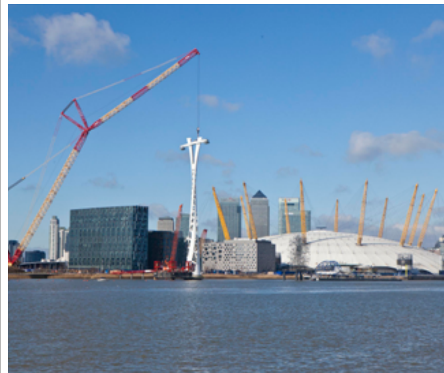
It remains to be seen if the cable car will be ready in time for the Olympics this summer