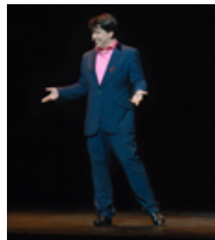
Funny bones: the comedian Michael McIntyre

19th - 23rd September 2012 Chelsea Old Town Hall, London SW3 5EE The Chelsea Antiques Fair has been a popular annual fixture on