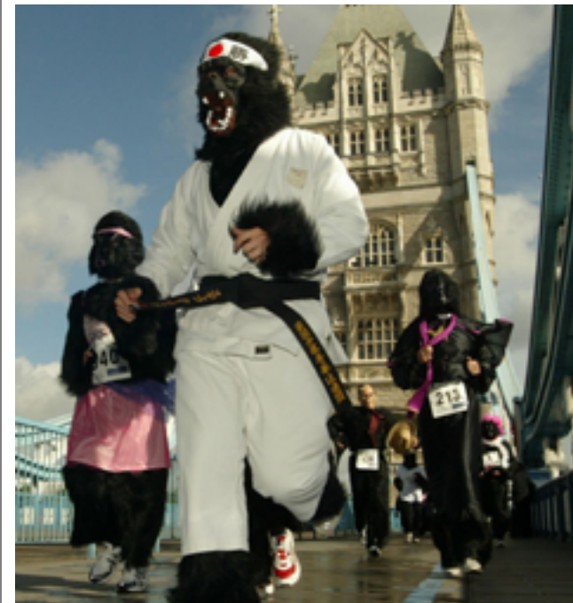
Gorilla Race: a banana in your pocket or just pleased to see me?

22nd - 23rd September 2012 Various venues across London So many of London's architectural landmarks are closely guarded secrets, off-limits to Joe Public. It's tantalising to imagine what goes on behind those closed doors. Well, thanks to the hugely popular London Open House Weekend, we need wonder no more. Almost 700 of the city's buildings - including the Bank of England - take part in this fantastic, free annual event, now in its 19th year, by opening their doors to everyone. The popular event offers a wealth of historical landmarks to choose from including some of the most beautiful architectural achievements in the city. You can also get inside