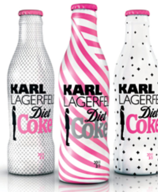
The London Design Festival includes some of designer Karl Lagerfeld's limited-edition Diet Coke bottles

KARL LAGERFELD DIET COKE COURTESY LEXIS PR DANIE GABRIEL ROSSETTI LADY LUITH 18661808 © DELAWARE ART MUSEUM, SAMUEL AND MARY R. BANCROFT MEMORIAL, 1935